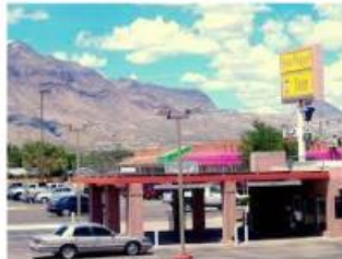
San Miguel Inn, Socorro