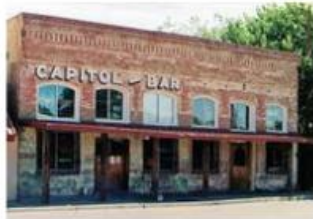
Capitol Bar, Socorro

Over 300 businesses have reached out for assistance through the program